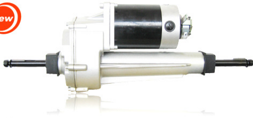
Technische specificaties CO4IV 11524 800W 24 Volt i=25/1